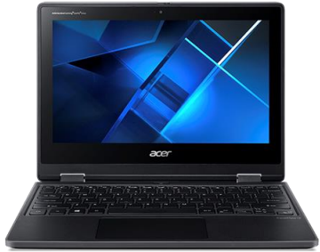
Acer TravelMate Spin B3